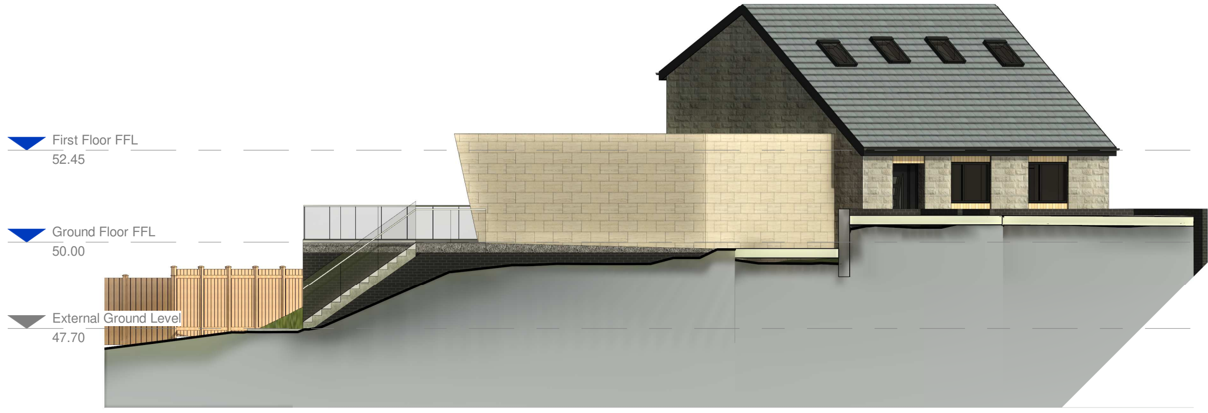
Proposed South Elevation 1 : 100